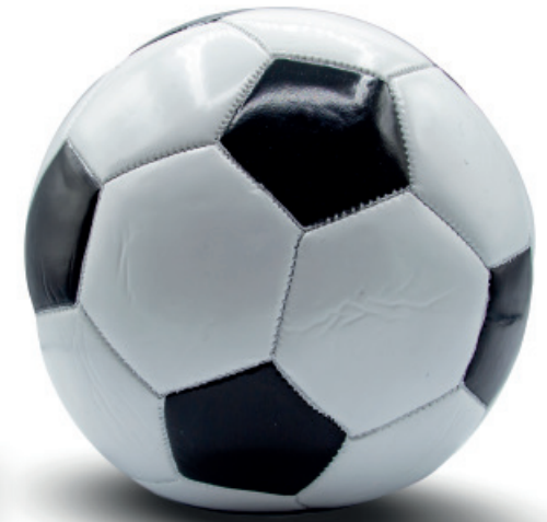
Black and White