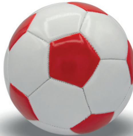
Red and White